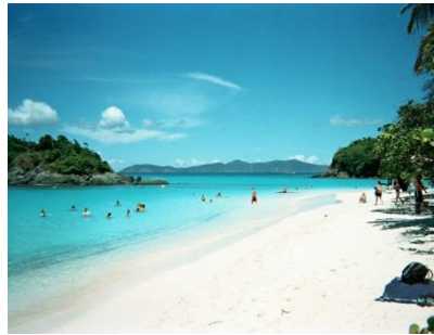
Trunk Bay, St John

yourself in the full service wide Wi-Fi, an Internet Café, can keep you in touch with Nassau, Bahamas is so much straw market for local crafts or merchants offering museum, or explore any of the the Queen's Staircase, and