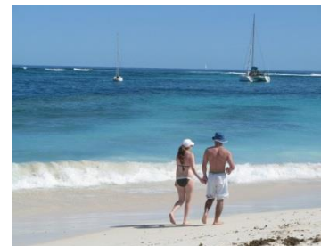
Orient Beach, St Martin

Allure of the Seas will dock on the St Maarten side of this half Dutch, Philipsburgh offers great shopping and a beachfront boardwalk leisurely strolls and people watching. Or, head to Marigot on the French for a meal, to ogle jetsetter yachts, or a walk to historic Fort Saint-Louis for a great view.