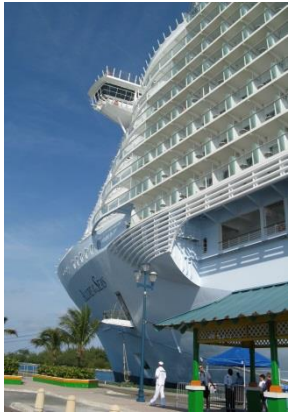
Allure of the Seas

Join us for our eighth Caribbean Seminar Cruise, January 2014. We will be aboard Royal Caribbean's Allure of the Seas, sailing round trip from Fort Lauderdale, Florida. Allure of the Seas will call at Nassau, Bahamas, Charlotte-Amalie, St Thomas, and Philipsburgh, St Maarten. Three days will be spent at sea. Our group is open to all Ontario REBBA 2002 registrants, their families, friends, and associates.