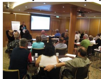
Classroom aboard ship

half French that is made for side (St Martin) up the heights